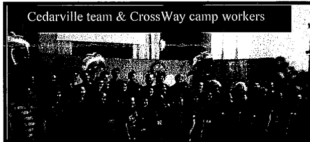
Cedarville team & CrossWay camp workers